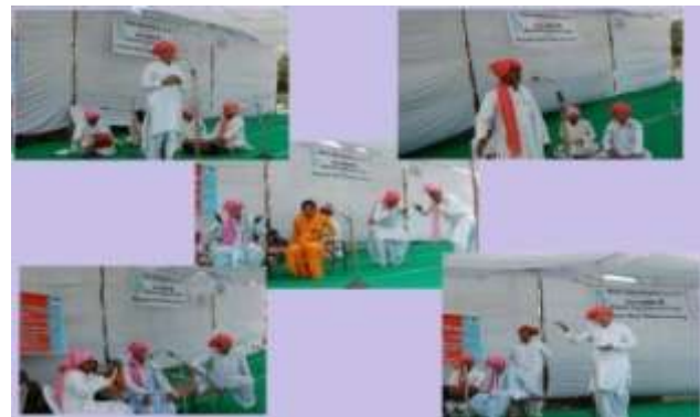
Creating Awareness through Haryanvi Saang

A Haryanvi Saang, a folk of Haryana, on Disaster management has been prepared for information dissemination on disaster preparedness. Hazard specific IEC materials on earthquake, flood, fire and draught are in progress and will be printed under 13 th Finance Commission grant. These materials will be distributed in schools, different government departments, local administration and Panchayats.