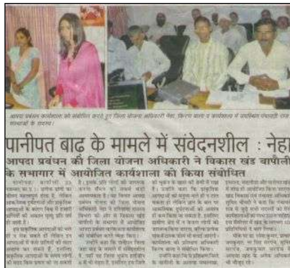
PRI training at Bapoli Block, Panipat in news

A training programme on “Mainstreaming Gender Equality into Disaster Risk Reduction” have been conducted at training center of community health center in Samalkha, Panipat to build the capacity and improve the skills of Asha Workers on first aid, Fire Safety & Disaster Management. Asha Workers are the important part in village level disaster management plan and committee at village level. The aims of this programme was to provide health leadership and effectiveness for Emergency Preparedness and Response and will provides an opportunity of partnering with the leaders of Panchayat to put forth Disaster Risk Reduction Programme agenda at grassroots level, and build up an influential advocate for women’s issues in case of any emergency and the other aim of conducting this training programme was to make Master Trainer to contribute to make change the traditional gendered rules of women as caregivers. These masters trainer to make progress for the greater participation of women in training of First Aid, Fire Safety as well as other aspect of Disaster Management like Search and Rescue, Fire Safety, Evacuation and Early Warning etc.