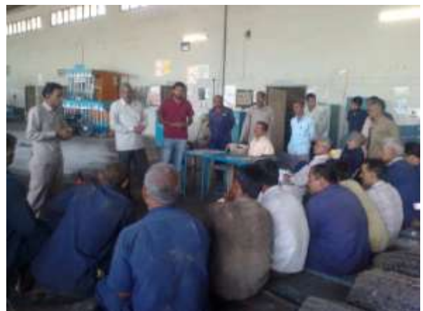
Orientation on Fire Safety to the Staff of Haryana Roadways