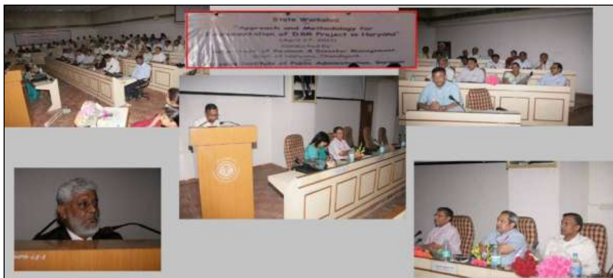
Highlights of State Level Workshop on DRR Mainstreaming

State level advocacy workshop has been organized on 29 th April 2011 at HIPA, Gurgaon. Around 80 participants representing line departments attended the workshop. Similarly, district level DRR advocacy workshops have been conducted in Rohtak, Faridabad and Panipat districts. The line departments were sensitized on the need for developing DM plans and issues pertaining to mainstreaming DRR into departmental plans.