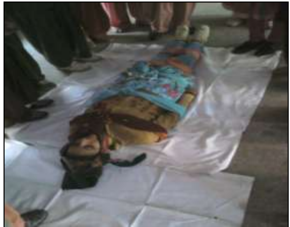
Stabilizing the patient with spinal injury by using local resources: A Demonstration during a First Aid training of Asha Workers at Panipat

In Panipat Training programme for PRI member have been conducted. About 40 Sarpanches and other PRI members were trained on DRR, their roles and responsibilities pre, during and post disasters, and mainstreaming DRR into the local development plan.