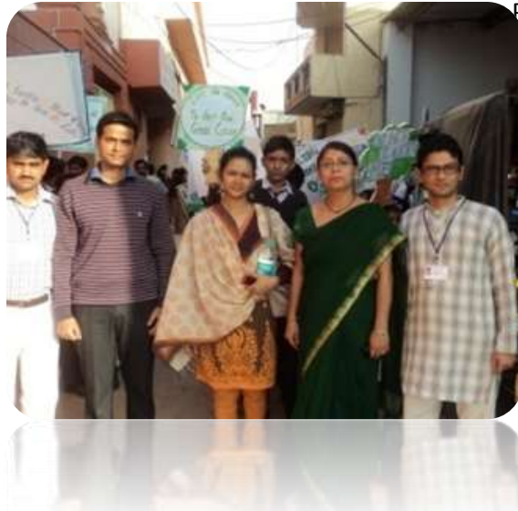
Establishment of Three tier structure of First Responders (at household, community and government level)