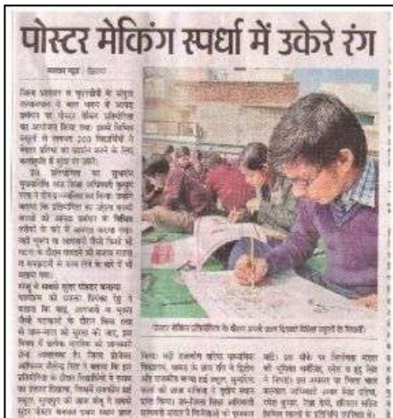
Awareness Generation Programmes in DRR Districts in News

School Disaster Management Awareness programmes have been conducted in all the three DRR Districts. Poster/drawing competitions, essay writing competition, slogan writing competition, fire safety trainings are the main events of these awareness programmes.